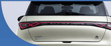
Geometric broken line penetrating LED taillights