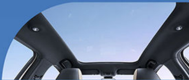
Leaping curtain panoramic canopy