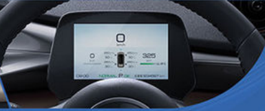
Real-time tire pressure display