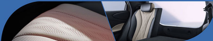
Heated front seats