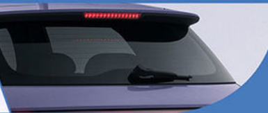
electric rear wiper