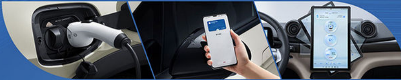
VTOL mobile power station