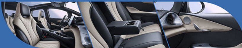
One-piece color-blocked sports seats