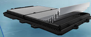
High safety and long life blade battery