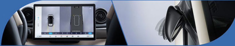
Megapixel HD video