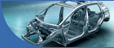
High strength body structure