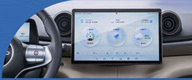
Dipilot intelligent assistant driving system